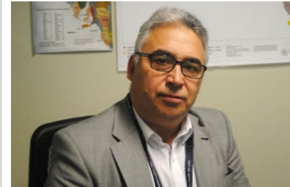
UMIT AGIS Health